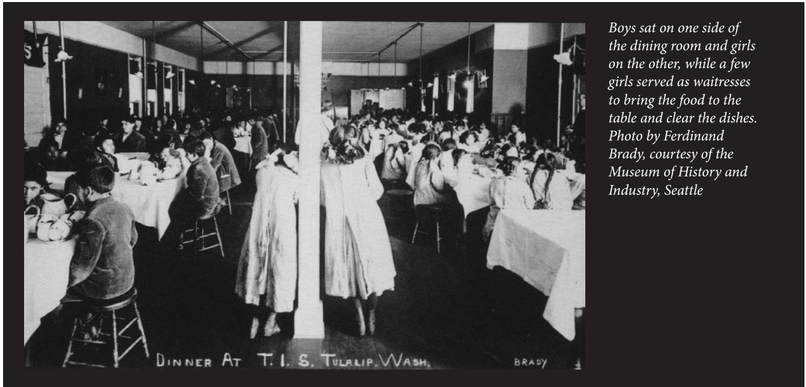
Boys sat on one side of the dining room and girls on the other, while a few girls served as waitresses to bring the food to the table and clear the dishes.

My mother spent much of her early years with her grandparents, who spoke only Skagit Lushootseed, a dialect of the Salish Indian language common to most of eastern Puget Sound from the Nisqually to the Skagit rivers. At age six, my mother spoke almost no English, only Skagit. Then, she spent three years at the Indian boarding school at Tulalip, run by the federal government.