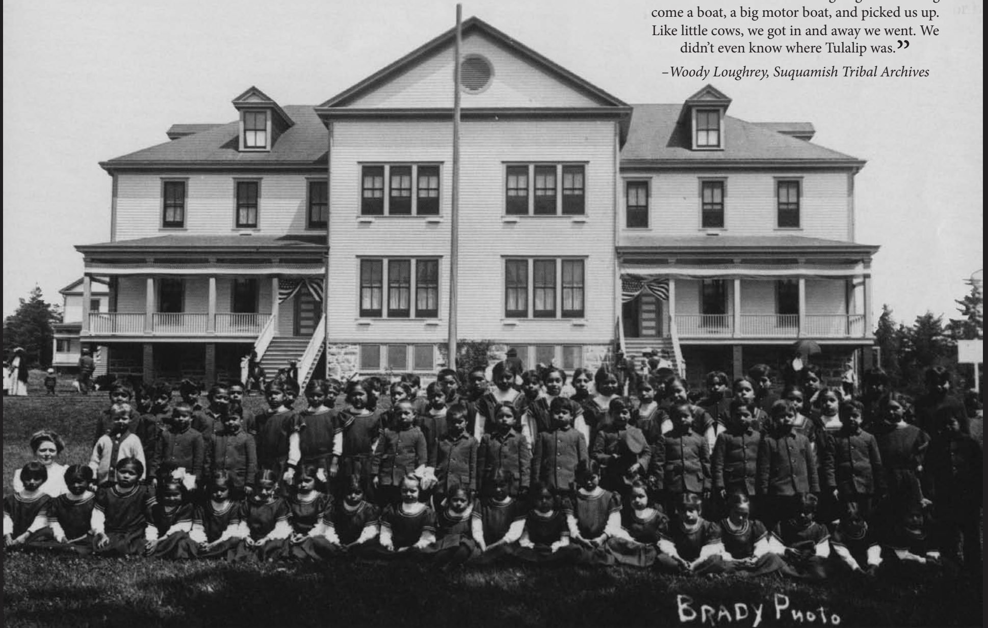
The Tulalip Indian School opened in 1905 and soon held a capacity enrollment of 100 boys and 100 girls, who lived in separate dormitories.

—Woody Loughrey, Suquamish Tribal Archives