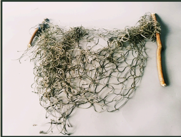
Figure 1. Dip net, 1910s Wayne Williams Collection, Hibulb Cultural Center

Figure 2 is a replica of a much larger net that would have been used to block the salmon run in rivers. When the salmon run was blocked, a fisherman could reach down with a long pole with a dip net attached to the end and scoop up the fish. William Shelton often taught and shared Coast Salish culture to various communities. This net is one he made to show the technique of constructing a fishing net and the uses it had, it would not have been used in actual fishing.